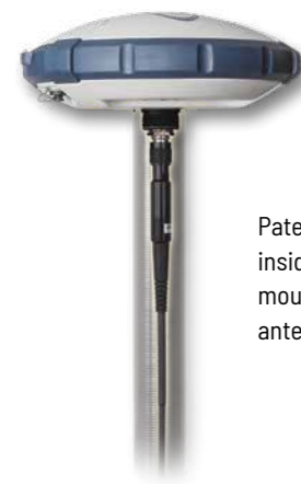
Patented inside-the-rod mounted UHF antenna design